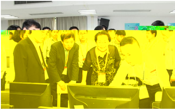
wxQy8 'zc{ | } |

z z Q y z N E 1 5! "+wYZ • I m 9c{ | 3 6! K7! "+d$%&T] W +wYZWd$R%&[ \VR+w QT-\ } 10 ( ZABV 2017 8c A9XK OxV5